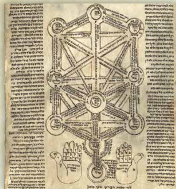
"EARLY HASIDIC ILAN"